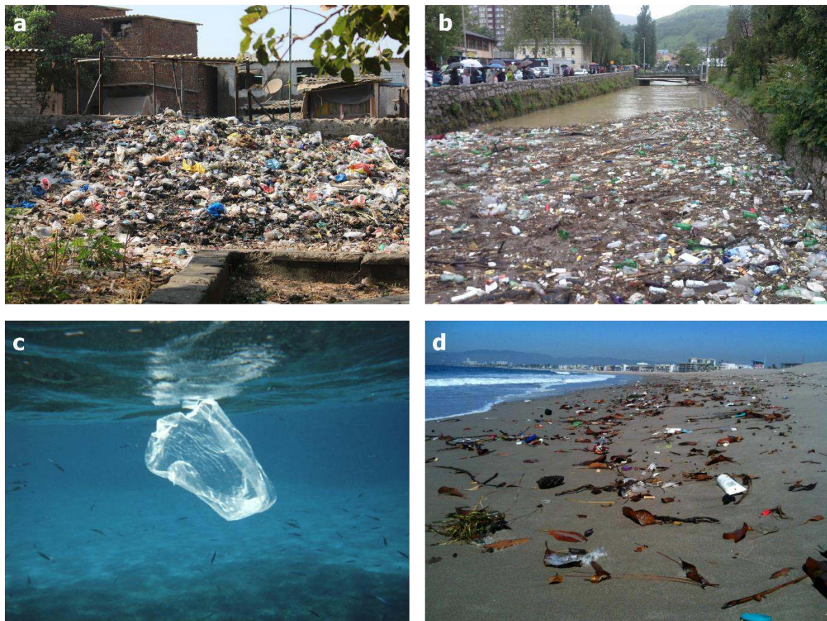
Fig. 2. Images of plastic pollution across a range of environments a) terrestrial, b) riverine, c) marine and d) coastal. Any large items can degrade to form secondary microplastics.

Although the majority of freshwater microplastic studies tend to focus on rivers, it is understood that microplastics are also prevalent within ponds and lakes. 23-25 In the same way as rivers, these will receive inputs from land runoff and wind-blown debris, however due to the enclosed nature of lakes it is likely that inputs of microplastics to standing waterbodies will lead to accumulation over time. 23