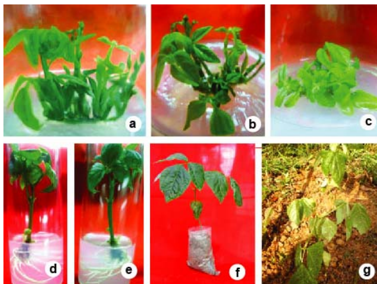
Fig. 1a - g. In vitro regeneration of Vigna unguiculata ssp. sesquipedalis . a - c. Multiple shoot regeneration from nodal segment (a) and shoot tip (b) explants on MS medium supplemented with 0.5 mg/l BAP + 0.2 mg/l NAA and leaf segment (c) explant on MS supplemented with 1.0 mg/l zeatin and 0.2 mg/l NAA. d - e. Root induction on half-strength MS supplemented with 3.0 mg/l IBA. f. Regenerated plantlets in poly bag containing a mixture of sterile soil, sand and compost (2 : 1 : 1). g. Plant in experimental field.

For further development of medium and enhanced shoot proliferation, coconut water, ranging from 5 - 10% (v/v) was added to the medium before pH adjustment. Coconut water exerted positive impacts in shoot number proliferation when 10% (v/v) was used. In response to 10% (v/v) coconut water addition, 17 shoots were proliferated per explant (Fig. 2). Wald et al. (1989) noticed