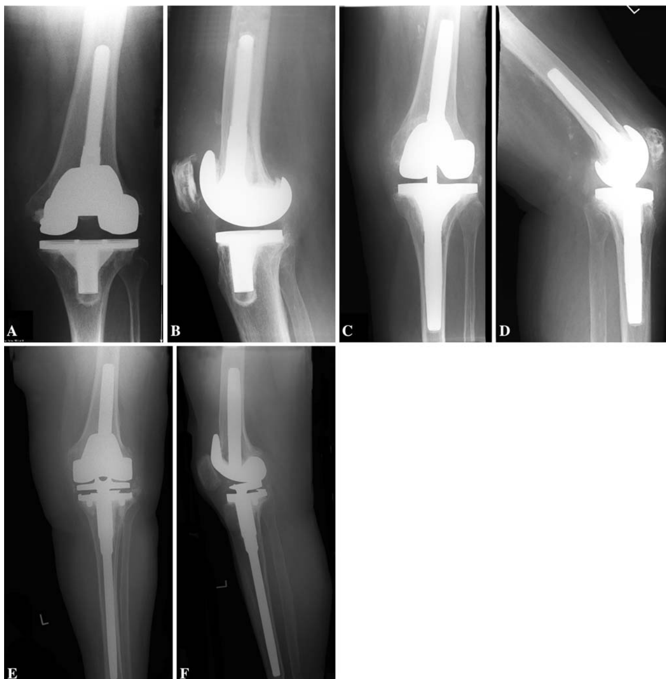
Fig. 1A–F Radiographic images of a modular posterior stabilized implant are shown from (A) the anteroposterior view and (B) the lateral view. Radiographic images of a condylar constrained knee

implant are shown from (C) the anteroposterior view and (D) the lateral view. Radiographic images of a rotating hinge implant are shown from (E) the anteroposterior view and (F) the lateral view.