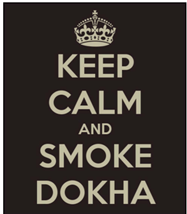
Figure 2 Marketing image found on posters, t-shirts, mugs and key chains.