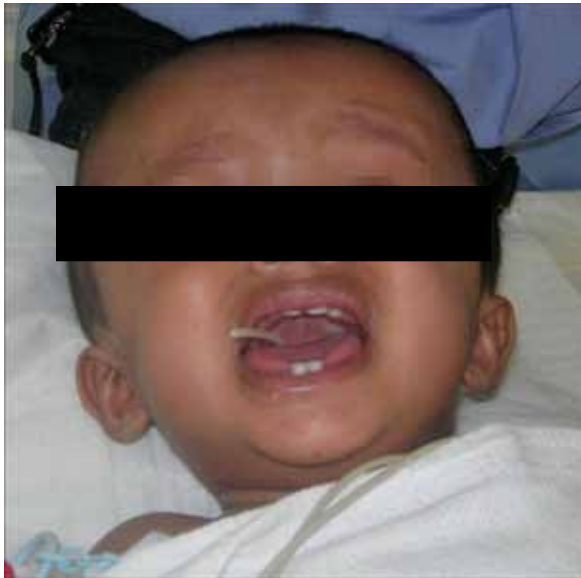
Figure 1: Ventriculoperitoneal shunt tip protruding periorally