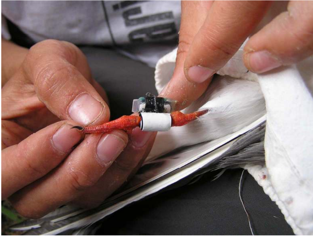
Figure S1: Leg of a Common Tern ( Sterna hirundo ) showing the Mk10 geolocator deployed on a darvic ring. 722x541mm (72 x 72 DPI)