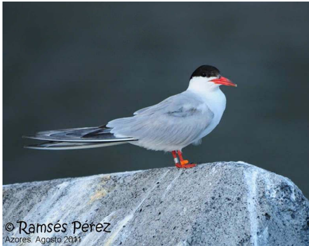
Figure S2: Picture of a Common Tern ( Sterna hirundo ) resighted in Lajes do Pico (Azores) in August 2011 and originally ringed in Punta Rasa (Argentina). 225x178mm (72 x 72 DPI)