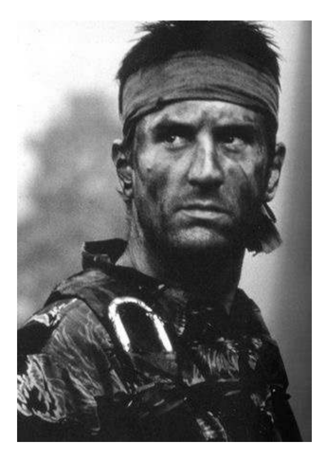
Figure 4: Mike in The Deer Hunter (1978), Universal Pictures

wounded soldier back into American society. Although this attempt to depict an authentic account of Vietnam was meant to promote national reflection and critical engagement with the war, Vietnam realism had another effect. The focus on the wounded soldier filled the void left by the demise of the patriotic image of the soldier. Moreover, the authentic account of the physical and psychological effects of war on the soldier during the 1970s established the foundation from which the norm of honoring the soldier became enforced by militarized patriotism.