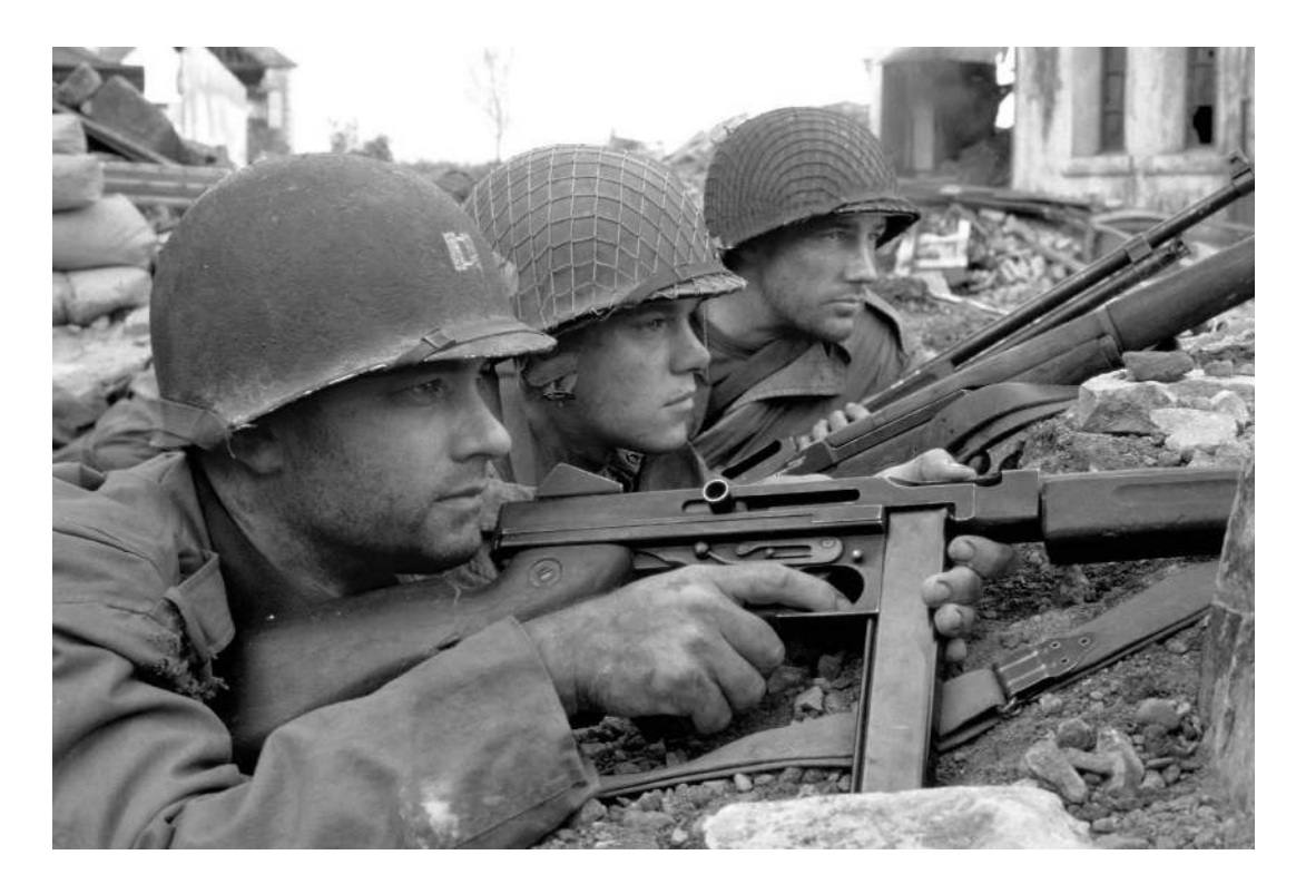
Figure 6: Cpt. Miller (far left) in Saving Private Ryan (1998), DreamWorks Pictures