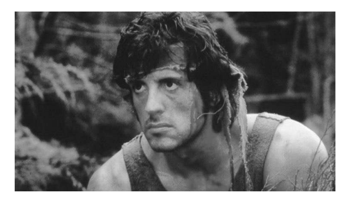
Figure 5: John Rambo in First Blood (1982), Orion Pictures