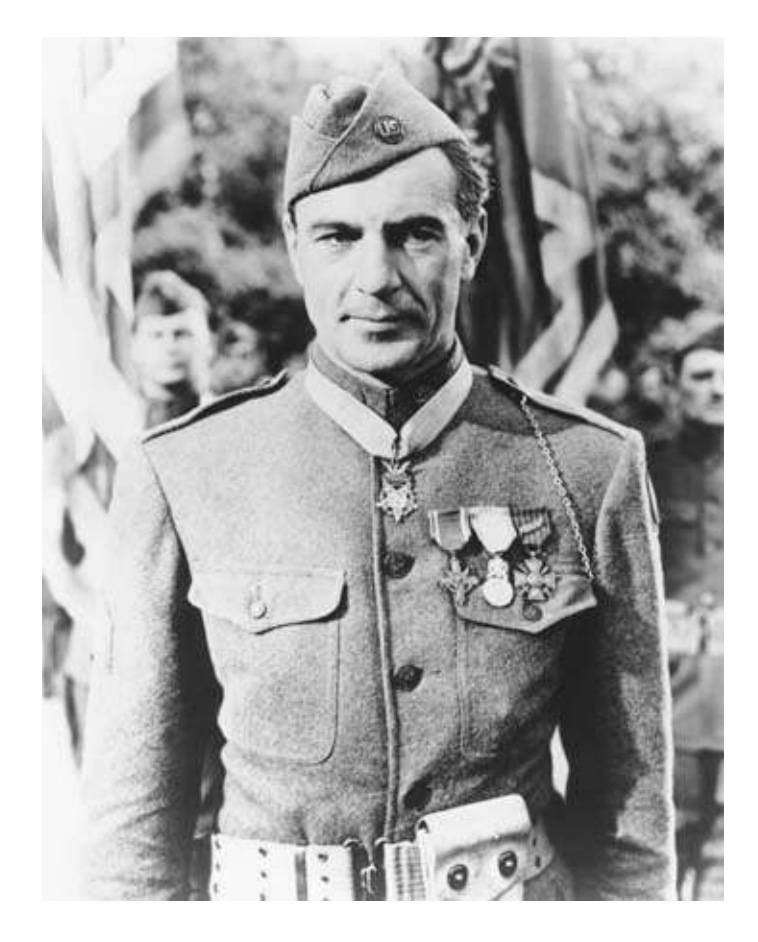
Figure 1: Sergeant York (1941), Warner Brothers