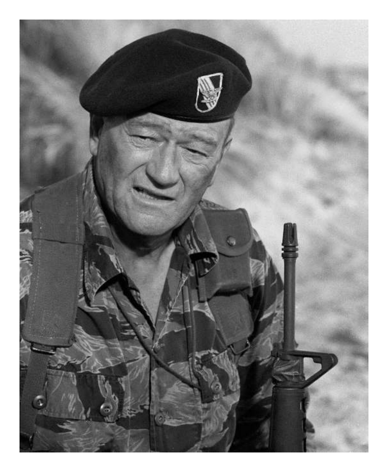
Figure 3: Col. Kirby in The Green Berets (1968) , Batjac Productions