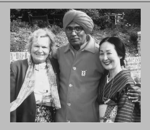
SHARED MILLENNIUM CHALLENGES FOR DEVELOPMENT AND FAITH INSTITUTIONS