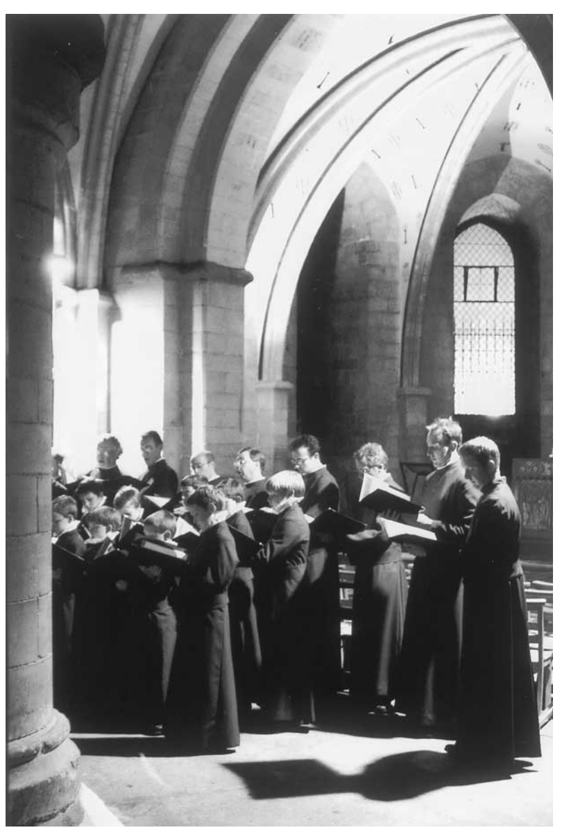
Canterbury Cathedral Choir