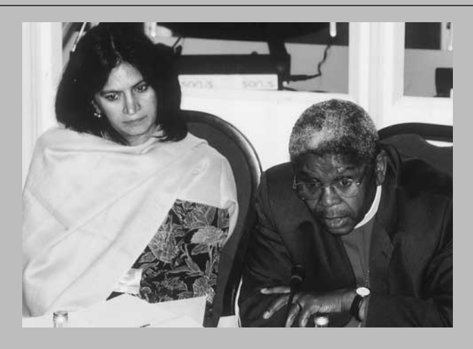
DEVELOPMENT AND FAITH PARTNERSHIPS IN FIGHTING POVERTY