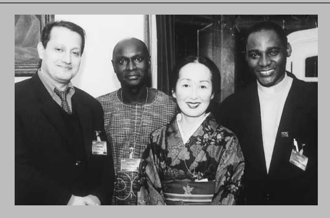
MEETING OF WORLD LEADERS ON FAITH AND DEVELOPMENT, CANTERBURY, UNITED KINGDOM, OCTOBER 6–8, 2002