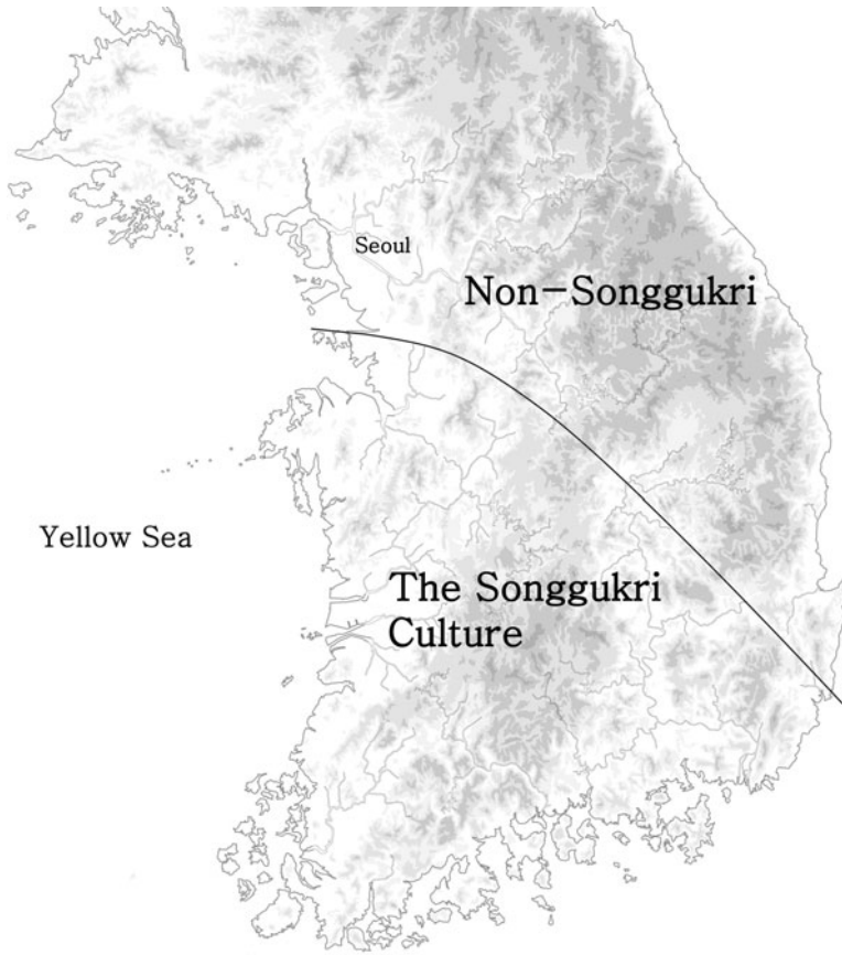
Figure 2. The distribution of the Songgukri Culture and non-Songgukri cultures.

development of the Songgukri Culture and the spread of wet farming in southwestern Korea were subsistence-technological innovations developed by local populations in order to solve a population–resource imbalance resulting from rapid population growth and reduced soil fertility owing to long, continuous farming in the Early Mumun Period (Kim 2003b). However, it is still unknown why the Songgukri Culture and wet farming techniques remained confined spatially to southwestern Korea and did not spread to central Korea. In our view, the spatial division of material culture and subsistence strategies between central and southern Korea was largely the result of differences in environmental factors. Whereas marshes and bogs are well distributed in southern Korea, they are rare in the more mountainous central Korea, which would have made the construction and use of rice paddies far more costly in that area.