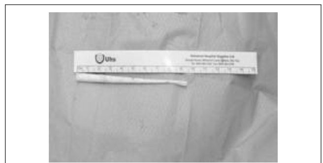
Figure 1 Surgisis® anal fistula plug

Step 1: An upper gastrointestinal endoscopy is performed, positioning the endoscope proximal to the oesophageal defect. A guidewire is passed through the endoscope and allowed to enter the oesophageal lumen. An endoscopic snare is introduced into the fistula tract via the left-sided chest drain until its position is such that the guidewire can be snared. The snare traverses the tubing of the chest drain laterally and the mediastinal abscess cavity medially to enter the oesophageal lumen through the residual defect in the oesophagus. With the passage of time, the mediastinal abscess cavity has significantly reduced in size, resulting