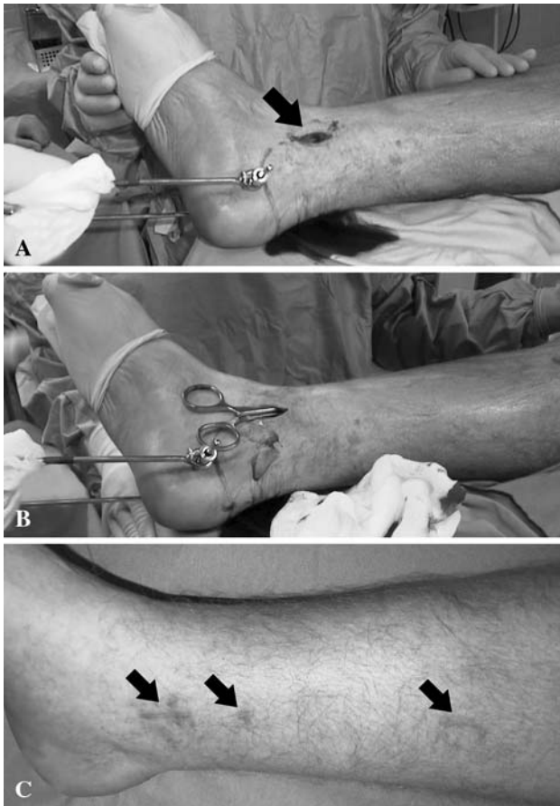
Fig. 1A–C (A) A calcaneal Steinmann pin is applied to reduce the fracture and to maintain the length and alignment of the limb. Small longitudinal incision is distal to the medial malleolus (arrow). (B) Through the small incision, the subcutaneous tunnel is created using an artery forceps. (C) Final scars (arrows) show the minimal nature of the exposure.

Distal to the metaphyseal fracture, we inserted bicortical or unicortical screws using as many of the distal plate holes as possible (maximum, nine holes). We used Kirschner wires to secure, through holes of the plate, the latter to the bone before screw insertion. At this stage, we assessed limb alignment by comparison with the other limb. We established the correct rotation evaluating the alignment of the proximal and distal cortices of the distal tibia and comparing at 90° of knee flexion the axis between the tibial tuberosity and the intermetatarsal spaces. Screws were then inserted percutaneously through stab wounds as necessary. The ratio between screws inserted and holes used was 0.65 (range, 0.6–0.8). The screening radiation time was