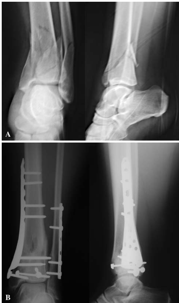
Fig. 3A–B (A) AO 43 C fracture and (B) plain radiographs after 1 year are shown. The fracture united with no limb shortening and the patient reports no use of walking aids and no limp.