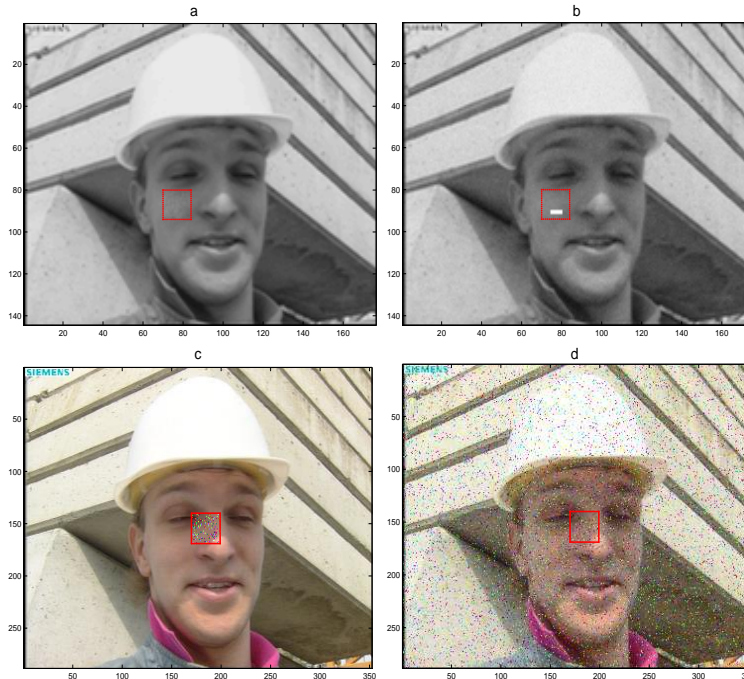
Fig. 1. Images a, b (black and white, top), c, d (color, bottom).

Devroye, 1994]) and the value k for the kNN estimator is set to 5. The true value of the parameters of interest is (80, 70) . Table 1 contains the means of the estimates obtained for 100 runs of the experiment described above. The two ME estimators estimate \bar{\theta} without error in 100% of the runs and thus appear insensitive to the presence of outliers (the white patch).