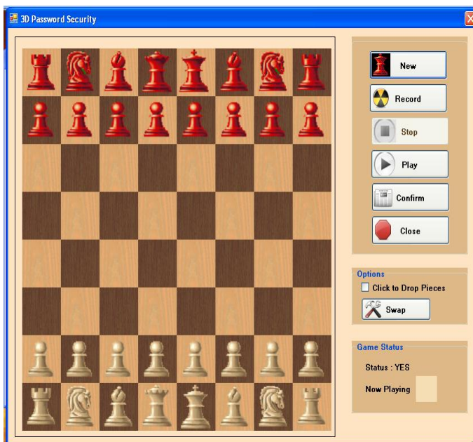
Figure.1: Environment1 (Chess)

The working of each button is as follows: