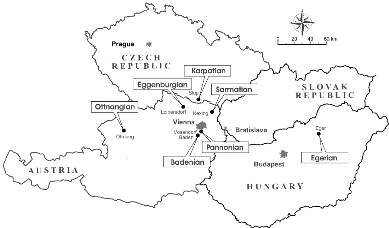
FIGURE 2 Geographic distribution of all Miocene stratotype localities of Central Paratethys stages.

palmatus and Gigantopecten holgeri going along with the extinction of the Eggenburgian endemics such as Oopecten gigas and Laevicardium kuebecki (Mandic and Steininger 2003). Another important immigration is represented by the fossil sea cow Metaxytherium krahuletzki being conspicuously common in the upper Eggenburgian but absent in older horizons. All that happens distinctly prior to the onset of the warm-temperate carbonate production on top of upper Eggenburgian siliciclastics (Roetzel et al. 1999). The onset of the warm-temperate carbonate factory is probably coeval with the slight cooling indicated by Zachos et al. (2001) and by the MBi-2 isotope event of Abreu and Haddad (1998) (Fig. 1). The loss of tropical mollusc taxa between the middle and the upper Eggenburgian could coincide with the MBi-1 isotope event.