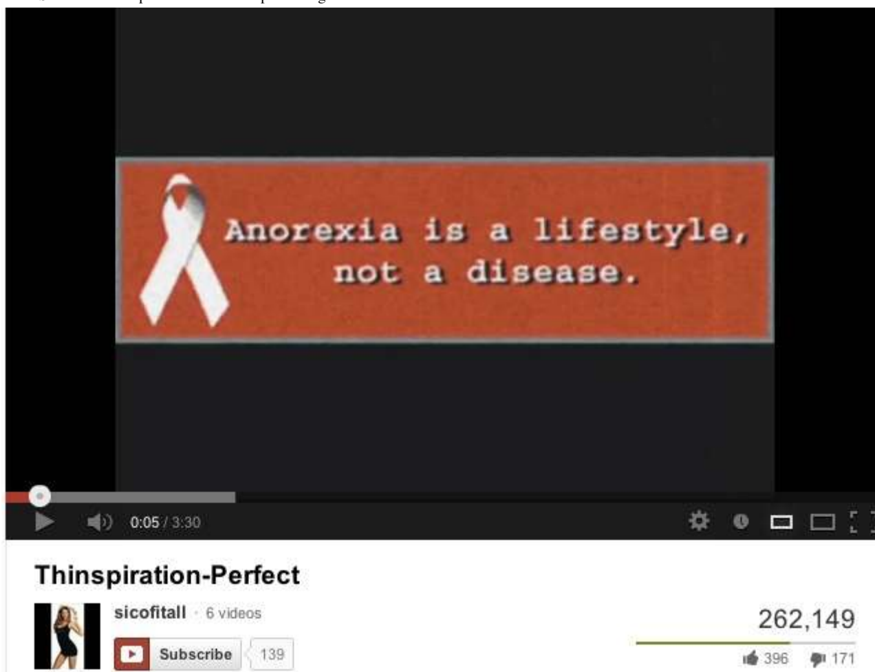
Figure 1. Screenshot of a pro-anorexia video promoting misinformation.