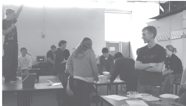
Figure 2: Students taking part in the Undergraduate Physics Olympics

The Undergraduate Physics Olympics is a team based event run during the University's Welcome Week encouraging new physics students to get to know one another while doing some fun, competitive physics experiments (figures 1 and 2) 1 .