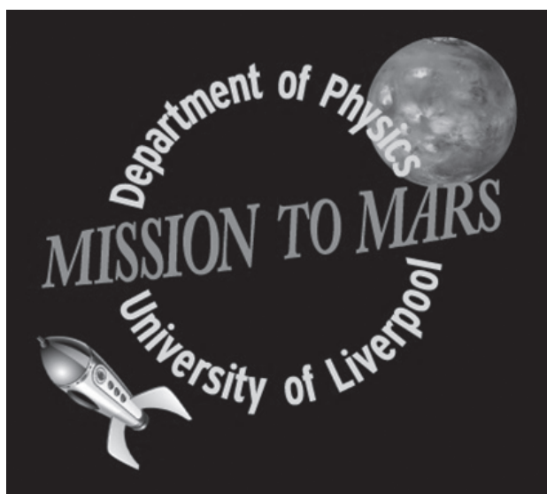
Figure 5: Design on the t-shirt given to participants

On the final morning, by which stage the research was expected to be complete, final year students (who had completed an optional module on the topic) delivered a session on communicating science in order to help a group of 40 students develop a coherent presentation for that afternoon. The final presentation took place in a lecture theatre in front of all staff associated with year 1. The groups used prepared materials on flip chart paper, spoke for the set 20 minutes, and to responded well to questions. The winning team were selected by the staff and each given a t-shirt designed for the project (figure 5). All students were also given a mini Mars Bar, which added to the convivial atmosphere as they left on the Friday afternoon.