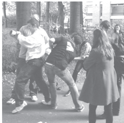
Figure 1: Students taking part in the Undergraduate Physics Olympics

The Undergraduate Physics Olympics is a team based event run during the University's Welcome Week encouraging new physics students to get to know one another while doing some fun, competitive physics experiments.