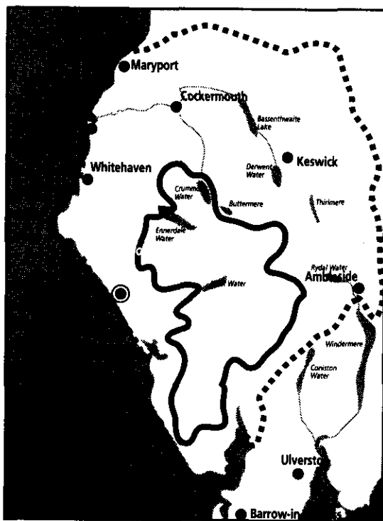
Figure 1. Map showing the restricted areas of Cumbria, from June 1986 (the original area), and from September 1986 (the present one).

Sellafield–Windscale is a huge complex of fuel storage ponds, chemical reprocessing plants, nuclear reactors, defunct military piles, plutonium processing and storage facilities, and waste processing and storage silos. It has developed from its original role in the early 1950s of producing purely weapons-grade plutonium into a combined military and commercial reprocessing facility which stores and reprocesses thousands of tonnes of UK and foreign spent fuel. It is by far the biggest employer in the area, with a regular workforce of some five thousand swollen by a construction workforce of nearly the same size. It dominates the whole area not only economically, but also socially and culturally.