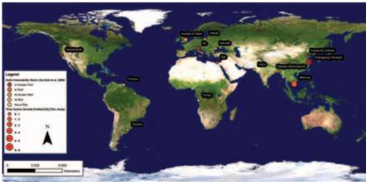
Figure 1. Estimated CO 2 Emissions from Drainage of Wetland Soils in Thirteen Large Deltas

This dataset is a small but representative case study subset of global coastal systems, including both temperate and tropical deltas. Almost all coastal systems are subject to wetland conversion and drainage, releasing CO 2 . Included with the emissions estimates is a description of delta vulnerability to potential flooding associated with present day sea level rise and reduced sediment supply from rivers (derived from Syvitiski et al., 2009). Technical description of analysis is provided in Annex 2.