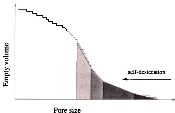
Fig. 2. Hypothetical pore size distribution for cement-based materials indicating that as more empty porosity is created due to self-desiccation, smaller and smaller pores are being emptied, in analogy to the filling of pores by mercury during an intrusion experiment.

It is the combination of chemical shrinkage and pore structure that determines the meniscus radius r [12], as shown in Fig. 2. The chemical shrinkage determines the volume of empty porosity created, while the pore size distribution determines the size of the largest water-filled pore for a given value of empty porosity volume. Based on measurements of internal relative humidity within hydrating cement paste, indications are that as chemical