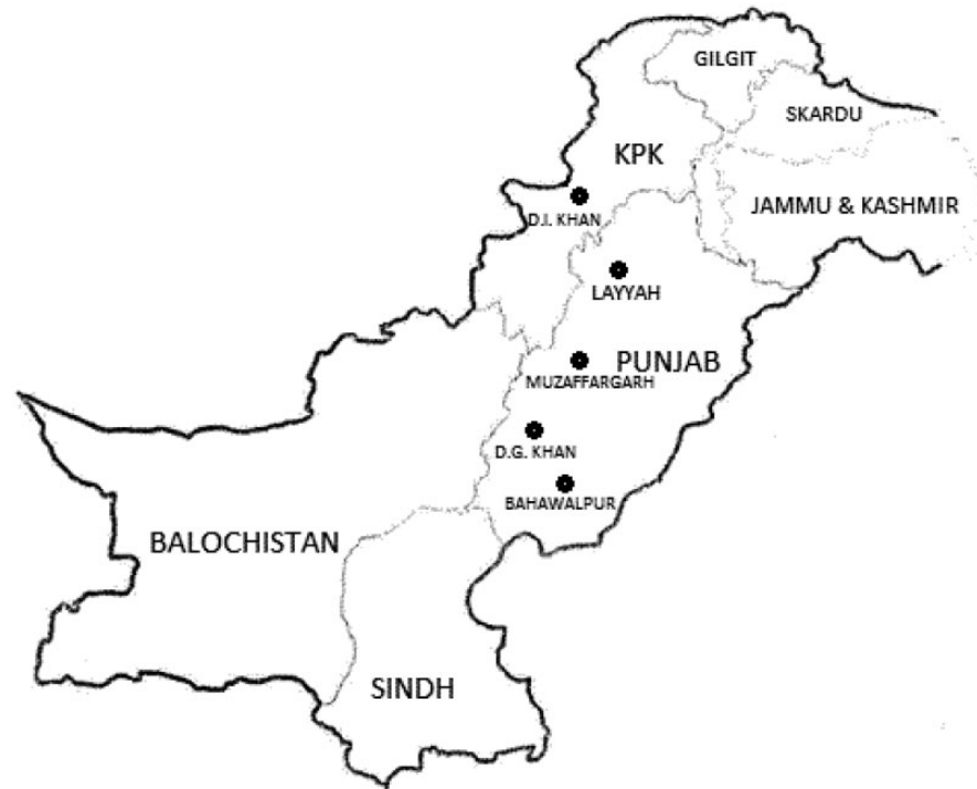
Fig. 1. Map of collection sites in Punjab and KPK provinces of Pakistan.