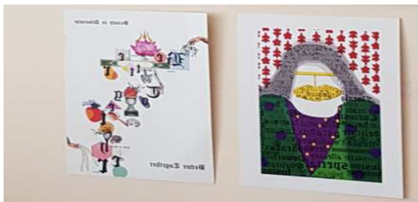
Figure 4. Picture of student's work-from Lisa's office wall.

Archival data also displayed some pictures display female students' collaboration inside the classroom using mobile devices, and this was as also reported by Azim saying that "One main aspect of UAE culture is boundless or connectivity." Archival data collected also showed Lisa's class work posted on her class Instagram page besides multicultural concepts; it displayed some of the flyers, images, and ideas that promote Arabic culture. Below is picture taken from Lisa's office wall.