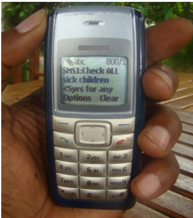
Figure 1. Example of mobile phones common in rural Africa. doi:10.1371/journal.pmed.1001176.g001

and treatment effectiveness surveillance, (2) monitoring the availability of commodities such as antimalarial medicines or