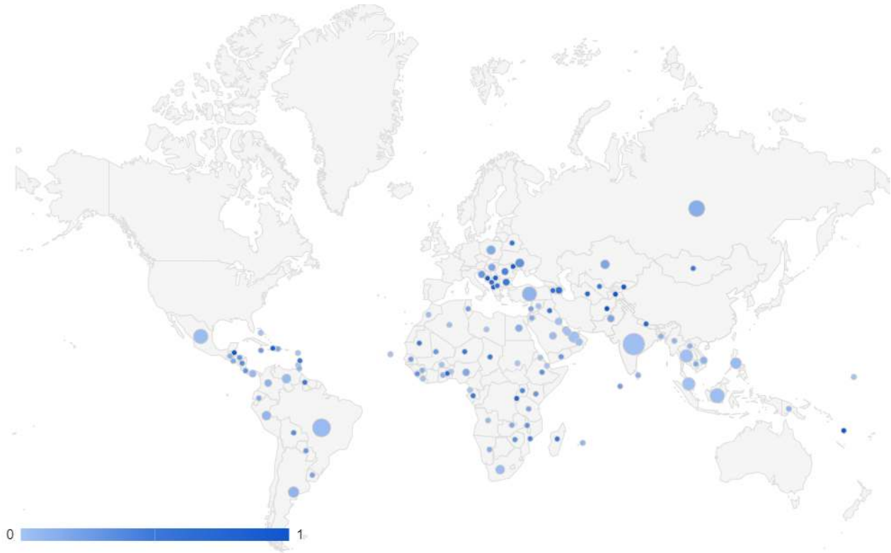
Figure 1: Number of Syndicated Loans and Share with MDB Support by Country, 1993-2017

Notes: The bubbles in the map represent the number of syndicated loans by country in 1993-2017. The area represents the number of total syndicated loans in the period: the larger the bubble, the more syndicated loans. The color represents the share of syndicated loans supported by at least one MDB in the period: the darker the blue, the more the syndicated loans receive MDB support.