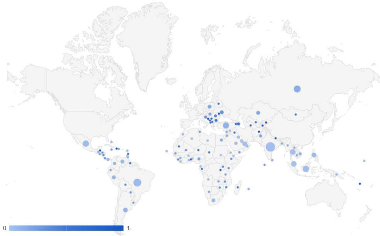
Figure 1: Number of Syndicated Loans and Share with MDB Support by Country, 1993-2017

Notes: The bubbles in the map represent the number of syndicated loans by country in 1993-2017. The area represents the number of total syndicated loans in the period: the larger the bubble, the more syndicated loans. The color represents the share of syndicated loans supported by at least one MDB in the period: the darker the blue, the more the syndicated loans receive MDB support.