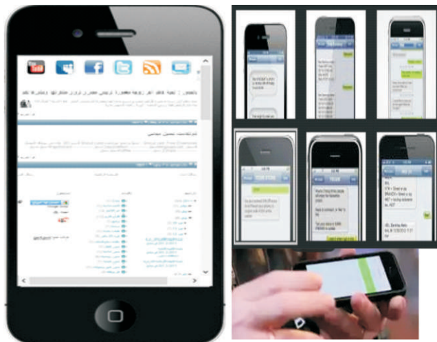
Figure 1. Text Moblogging (TMB)

Chen and Huang(2010) converts the Knowledge Management process into practical teaching methods. Without being limited by a classroom, learners can browse