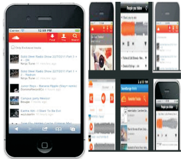
Figure 2. Audio Moblogging (AMB)