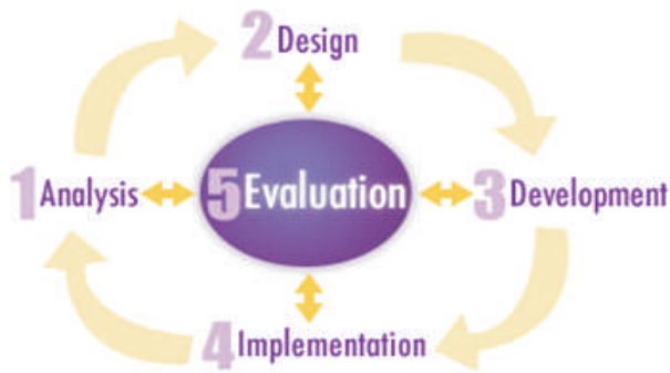
Figure 3. ADDIE Model

pre-requisite learning, Knowledge Management skills.