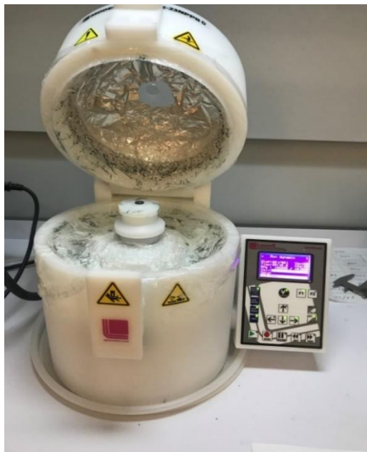
Fig. 2. Spin coater model WS-650MZ-23NPPB