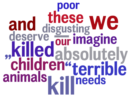
Figure 4: Word cloud of high distress 1-grams.

Figure 5 displays the distribution of the message length of our corpus in tokens. As can be seen the majority of messages contain between 60 and 100 tokens. Yet outliers go up to almost 200. The introduction of a character cap for the writing task proved successful in comparison to a pilot study where this measure has not been in place. In the latter case, the maximum number of tokens was nearly twice as high due to even stronger outliers.