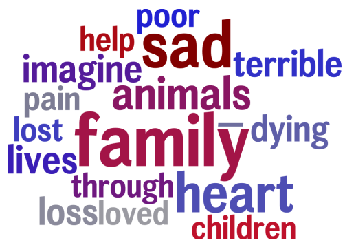
Figure 3: Word cloud of high empathy 1-grams.