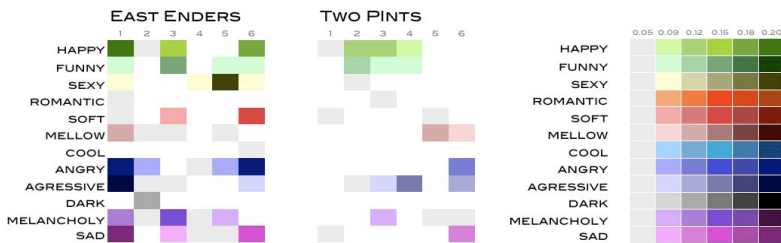
Fig. 3. LSA cosine similarity of the soap “East Enders” and the comedy “Two Pints” against 12 frequently used last.fm affective terms accumulated over six episodes

Enders” are roughly twice as high as in the comedy “Two pints of lager”. The contributions of affective components in both histograms are unbalanced, but whereas the former series has a bottom-heavy emphasis on angry and sad emotions, the balance is reversed in the latter with a shift towards predominantly happy and funny elements complemented with soft and mellow aspects. These patterns can similarly be made out when considering the emotional components plotted over time for the soap and comedy respectively (Fig.3). The distribution in “East Enders” is much more dense and emotionally saturated reflecting aspects of arousal , while the character of “Two pints of lager” seems mirrored in a pronounced clustering of lighter elements of positive valence and an overall sparsity of excitation within the matrix.