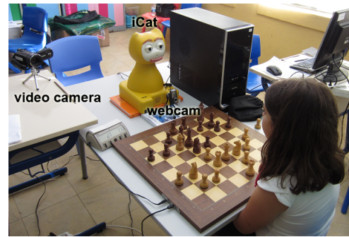
Figure 1: Setting of the Experiment.

To analyse how children respond to the empathic behaviours implemented in the robot, we conducted a field experiment with three different control groups (neutral, random_empathic and adaptive_empathic), as described in the previous section. With this ethnographic study, not only we intend to capture children’s reactions to the robot in a real setting, but also to identify patterns of responses and explore new ways in which we can improve the design of empathic robots.