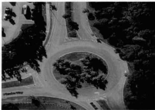
Fig. 1 Roundabout

vehicles behind, traffic volume, and driver's gender. According to the field survey, the utes are usually associated with a shorter follow up times, while the follow up times of vans and trucks are generally longer. In this study, we categorize the vehicles into three types: utes, cars (sedan, coupe, hatchback, and wagon), and heavy vehicles (van, bus, and trucks). It is also found that the follow up times of first queuing vehicles (i. e. 2nd vehicle in the approaching queue) are usually shorter. This is perhaps because these drivers are better prepared to follow up. Further, the vehicles with waiting ones behind might have a shorter follow up time. We use the binary variable to represent the vehicle positions in a queue ('0', first queuing vehicle; '1', others). Similarly, the binary variables are used to represent the drivers' gender ('0', female; '1', male) and whether there are waiting vehicles behind ('0', no; '1', yes). Drivers' age could also be a contributing factor. However, as this study is an observational one, it is thus difficult to assess the age of participants. Therefore, the impact of age is not considered in this research.