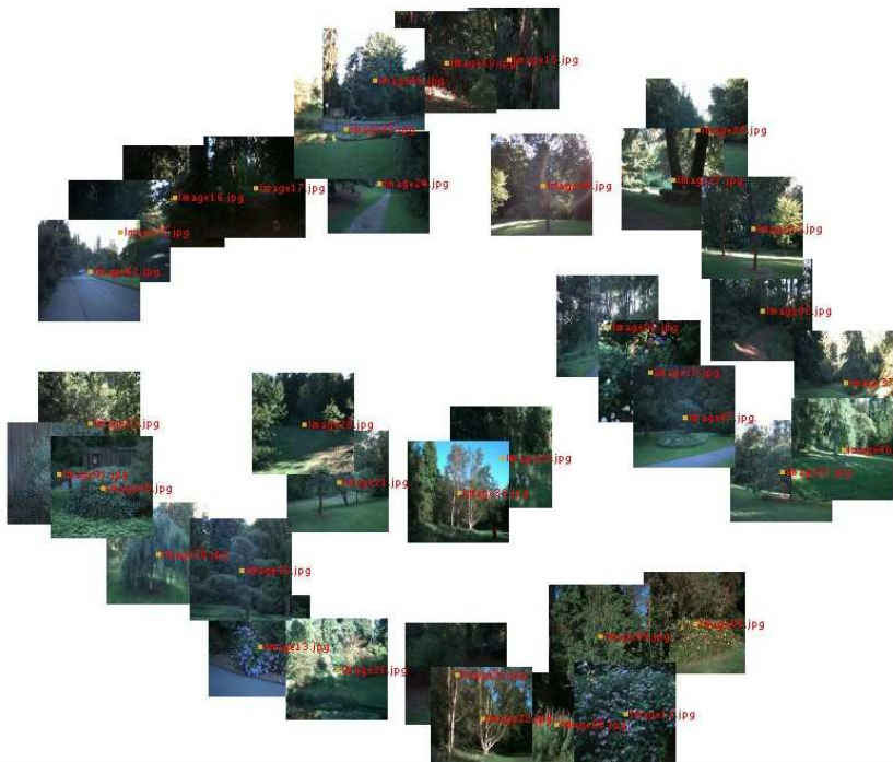
Fig. 2. Two-dimensional Sammon mapping calculated from the pair-wise distances between images, when the distances were estimated using ICA as an approximation for entropy. Even though the Sammon mapping is used to preserve the distances in the two dimensional visualization as well as possible, the individual rankings are not directly comparable to the mapping.

It seems that the ICA method (Fig. 2, Fig. 4 left) is affected mostly by the texture of the images. It is able to nicely group different kinds of trees according to their appearance. The method do not seem to be very specific with regards to the grass appearing in the images.