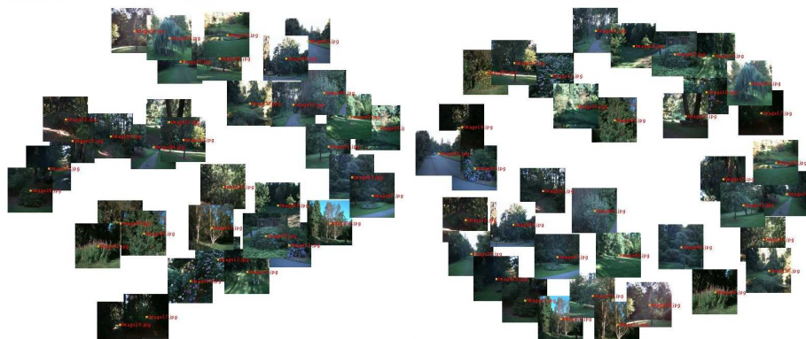
Fig. 3. Two-dimensional Sammon mapping calculated from the pair-wise distances between images, when the distances were estimated using the KL-divergence (left) and compression-based approximation for Kolmogorov complexity, NCD (right). Even though the Sammon mapping is used to preserve the distances in the two dimensional visualization as well as possible, the individual rankings are not directly comparable to the mapping.

similarity. On the other hand that is exactly what one expects from complexity based similarity measures.