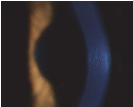
FIGURE 2: Sign of Vogt's striae showing fine vertical lines in deep stroma and Descemet's membrane of a keratoconus patient.

our knowledge, there is currently no comprehensive article that collectively summarizes the clinical and histopathological phenotypes associated with molecular and biochemical changes in KC. We hope that a better understanding of pathological changes associated with KC may promote further research to identify novel therapeutic targets that could stop or delay KC progression.