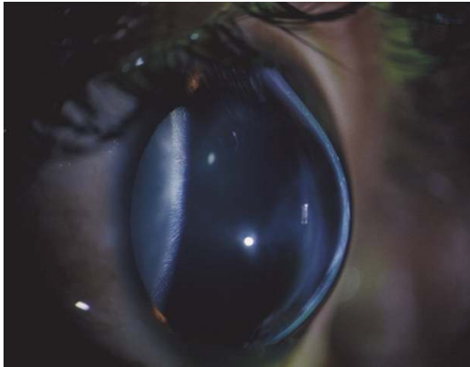
FIGURE 1: Cone shaped phenotype of the cornea in a keratoconus patient.