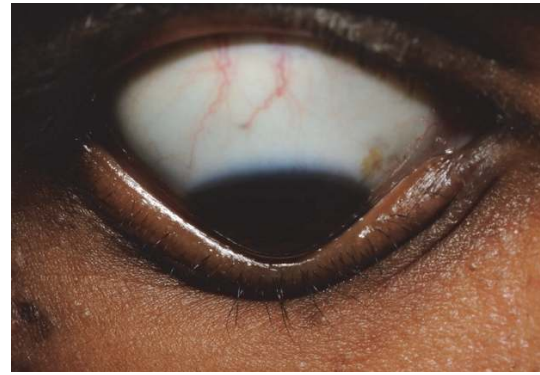
FIGURE 3: Münson's sign in a keratoconus patient which appears as bulging of the lower lid during downgaze.

1.1. Clinical Signs of KC. Clinically, the primary symptoms of KC are reduced visual acuity, photophobia, monocular diplopia, and glare. Due to disease progression, KC patients usually need frequent adjustment of their spectacle correction, and often vision cannot be corrected to 20/20 with spectacles alone [22]. In moderate to advanced KC, slit lamp examination can often capture clinical signs of KC, such as Fleischer's ring (iron lines partially or completely surrounding the cone), Vogt's striae (fine vertical lines in deep stroma and Descemet's membrane, Figure 2), corneal thinning, and Münson's sign (bulging of the lower lid during downgaze, Figure 3). Other accompanying signs that might appear are increased visibility of corneal nerves, apical thinning, anterior stromal clearing lines, subepithelial fibrillary