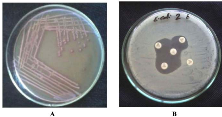
Figure 1. (A) E. coli on chromogenic agar. (B) Detection of ESBL production tested by the Modified Double Disc Synergy Test (MDDST). The test was done by using a disc of amoxicillin-clavulanate (20/10 µg) along with four cephalosporins; cefotaxime, ceftriaxone, cefpodoxime and cefepime.