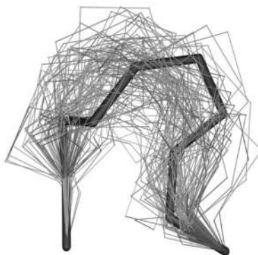
Figure 3. Loop Structure of 2act (198-205) produced by the local move MC method at 5000K and followed by clustering to generate 100 representative conformations. Black stick represents the crystal loop structure, and gray wires represent the 100 representative loop conformations.