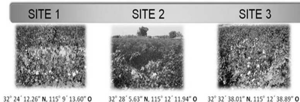
Figure 1. Images of the sites of collection of rhizosphere soil samples from a transgenic insect-resistant cotton crop in the Mexicali valley.

were made and 0.1 ml aliquots ( 10^3 - 10^5 ) were spread on plates containing potato dextrose agar (PDA). The PDA plates were incubated for 7 days at 30°C and morphologically different colonies that appeared on the medium were isolated and sub-cultured for further analysis.