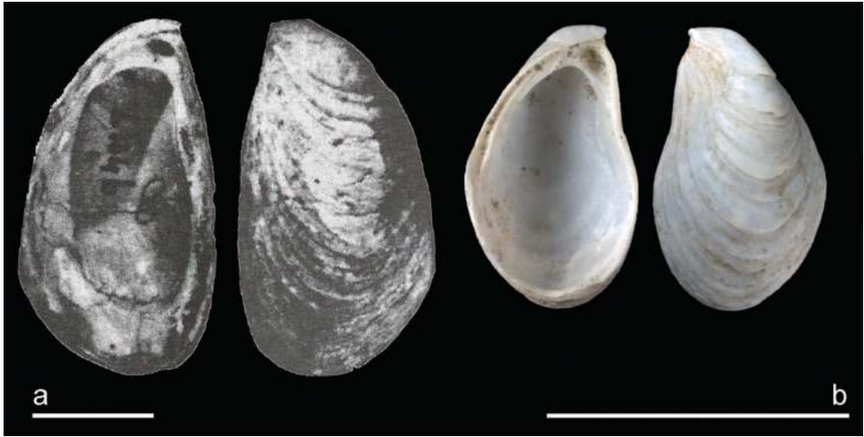
Figure 4. Lectotype Dreissena rostriformis versus D. grimmi . a D. rostriformis Deshayes, 1838. Lectotype. Pliocene, Crimea. Reproduced from Archambault-Guezou (1976, pl. 6, fig 2a-2c) b RGM.961901, D. grimmi (Andrusov, 1890). Caspian Sea offshore Aktau, Kazakhstan, sample KAZ17-21, depth 44.3 m. Scale bar: 1 cm.