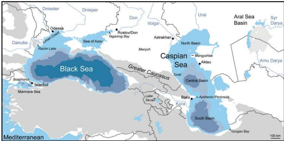
Figure 1. Map of the Pontocaspian region with the indication of major basins, rivers, regions, and cities referred to in the text.