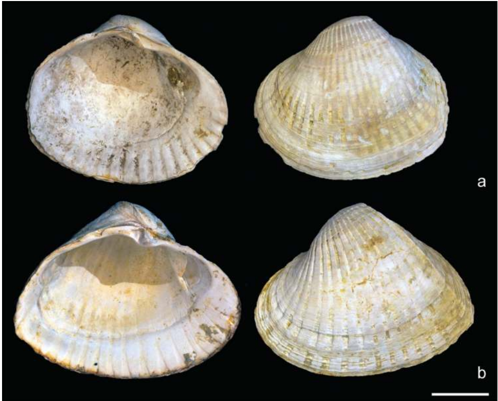
Figure 3. Didacna baeri versus D. eichwaldi from Holocene (Novocaspian) deposits of Turali Lagoon (Dagestan, Russia). a RGM.961899, Didacna baeri (Grimm, 1877) b RGM.961900, Didacna eichwaldi (Krynicky, 1837), same locality. Scale bar: 1 cm.

Taxonomic notes. In recent works (Kijashko in Bogutskaya et al. 2013), the species Didacna crassa (Eichwald, 1829) [= D. eichwaldi (Krynicky, 1837)] has been considered a synonym of D. baeri . However, we see morphological discontinuities in our extensive material from the northern Caspian Sea Basin that implies that D. eichwaldi with its protruding umbo and shouldered appearance is distinct from D. baeri that is characterised by a rounded umbo (see discussion above under D. baeri ). Despite being in common usage, the name Didacna crassa is invalid as it is a junior homonym of Cardium crassum Gmelin, 1791; Krynicky (1837) introduced Cardium eichwaldi as replacement name.