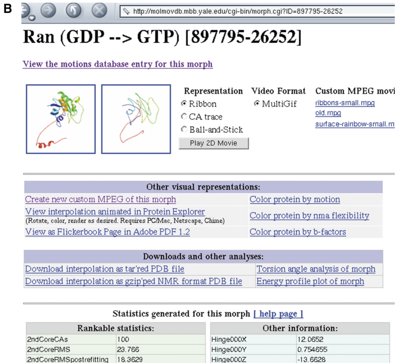
Figure 1. (Previous page and above) (A) Schema of the database, showing flow of information and relationship between motions and morphs. The ideal morph for each motion, where available, is shown with bold highlighting. (B) Page describing an individual morph. At the top is a listing of movies and images associated with the morph, followed by more elaborate representations. Complete trajectories are available for download either as a collection of files or as a single PDB file with multiple MODEL records. A comprehensive listing of statistics generated by the server appears below, along with the sequence alignment used as reference when generating the morph (not shown).