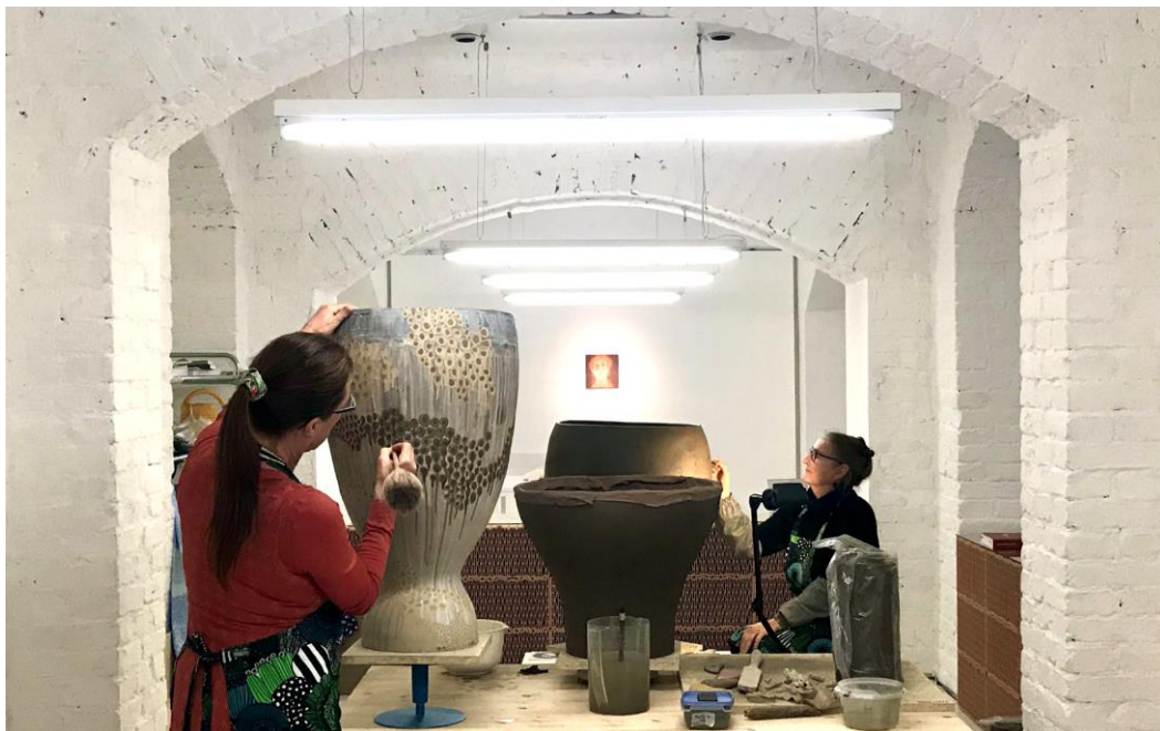
FIGURE 6. Practitioners 1 and 2 painting the vessels at the Soil Laboratory (node 26).