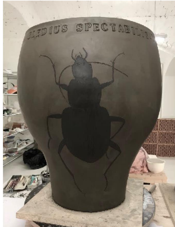
FIGURES 2 AND 3. Figure 2: Clay pit in Kultela (node 3). Figure 3: Ceramic vessel painted with motifs of critically endangered species (node 27).