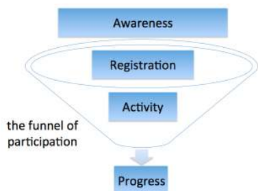
Figure 1: The funnel of participation

In formal education, despite concerns about drop-out rates, the total attrition from enrolment/registration to graduation is typically much lower. In a MOOC, the attrition rate is significantly higher – approaching those seen in marketing. This is the basis of the funnel of participation, as shown in Figure 1.