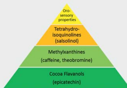
► Fig. 3 The mood pyramid: from general effects related to the flavanols, over more specific effects of methylxanthines and minor alkaloids, to the unique orosensory properties of chocolate.

and it remains questionable if they play a role in the psychopharmacological properties [58, 62].