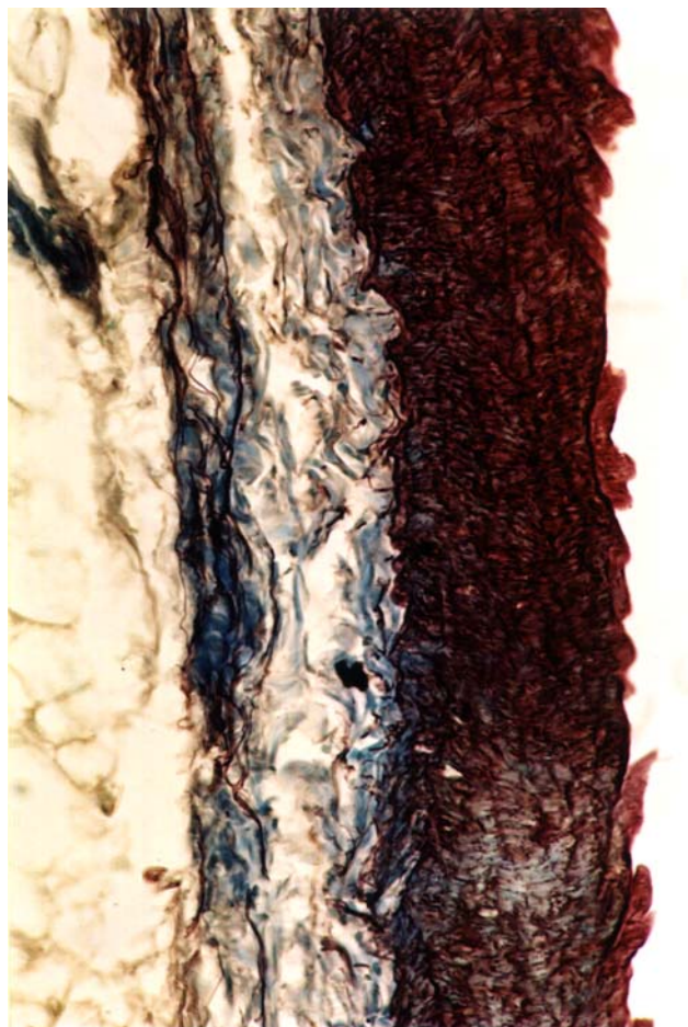
FIGURE 3 - Histomorphometry of control rat's aortic wall. The arrows indicate measurements. (Callejas - Original magnification: 200x). Digital image obtained using IPWIN32 software.