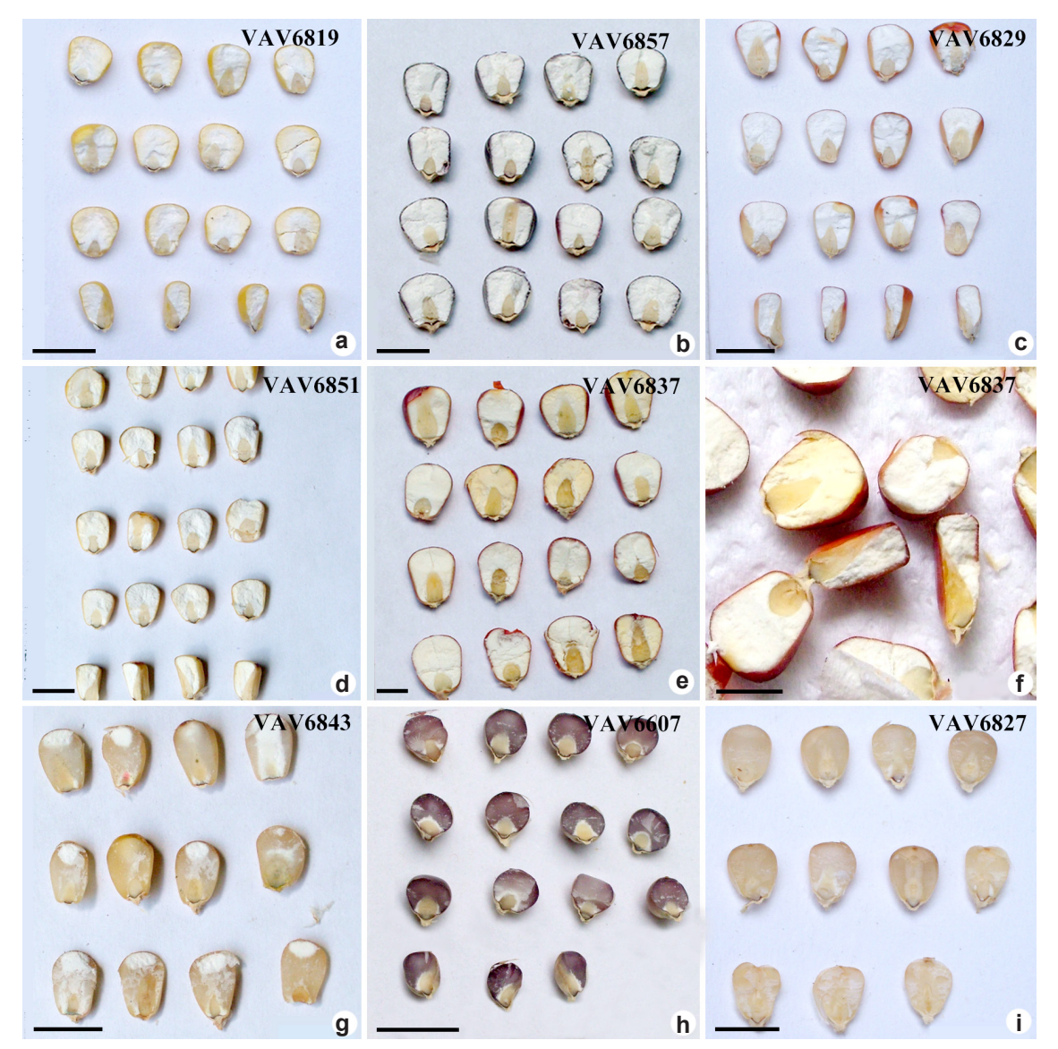
Figure 1 – a-i. Longitudinal-radial cuts of grains of Guaraní maize landraces – a-c. grains of Floury populations; d-f. grains of F-Pc populations (f. also shows longitudinal-tangential cuts); g-i. grains of Popcorn populations. Ref.: numbers correspond to voucher ears of the studied population. Bar = 1 cm.

The plants transplanted to the experimental field were used to estimate the phenological traits of the studied Guaraní maize populations. These showed differences in time from germination to tassel emergence, to spike emergence and to anthesis. In particular, a wide inter-population variability was observed for LVC, the time from germination to anthesis. The Pc populations had the longest LVC (108 - 124 d), F populations were precocious or had intermediate LVC (90 - 114 d), whereas F-Pc populations showed intermediate