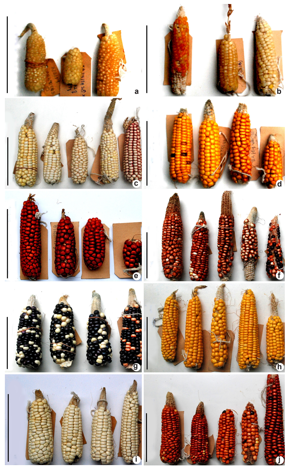
Figure 4 – a-j. Harvested ears – a. Pororó Chico; b. Pororó Grande; c. Blanco Ancho; d. Amarillo Angosto; e. Colorado; f. Variegado; g. Overo; h. Amarillo Angosto; i. Blanco Angosto; j. Variegado.