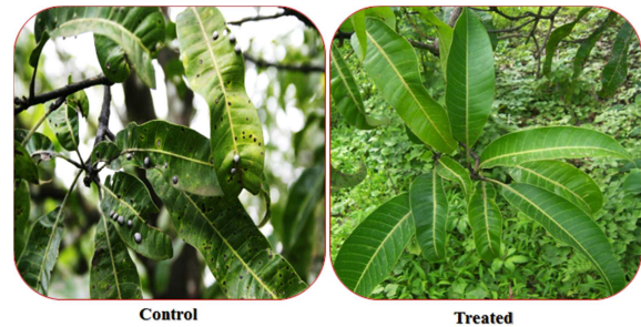
Figure 1. Representative photograph of mango leaves.

Leaves were more in number in the treated plants as compared to the control plants. Apart from leaves, the control mango trees showed an average 8 to 10 inches long flowering pattern with more male flowers. However, the flowering pattern of treated plants was completely transformed into compact one being 4 to 5 inches in length and having more female flowers. Moreover, 50 to 80% of malformation was consistently noticed in the untreated trees (Fig. 2).