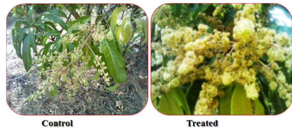
Figure 2. Flowering pattern of Alphonso mango ( Mangifera indica L.).

Clusters of fruitlets were observed in large quantity giving an appearance of 'jhumka' in the control sample. However, no such types of cluster of fruit lets were observed at the tip of the panicles. The weight of natured ripened mango was found on average 275 gm, medium sized with 50% lesser pulp in the control, while the biofield energy treated trees showed on the average weight of 400 gm, large sized and having more than 75% higher pulp.