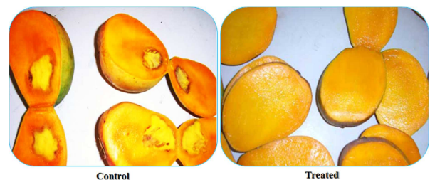
Figure 3. Representative photograph of mangoes with spongy tissue disorder.

After maturation of mangoes, the spongy tissues content were observed in fruit at ripe stage approximately 80% fruits were affected and at 16 anna maturity level about 60% fruits were affected with spongy tissue in control fruit. However, in biofield treated sample at 16 anna maturity stage the spongy tissue disorder was completely eradicated. The representative photomicrograph related to spongy tissues of control and in the treated mangoes are shown in Fig. 3.