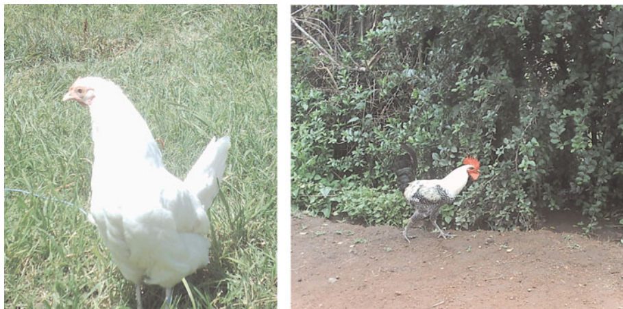
Figure 2. A single combed 'gebsima' male, and a female chicken of the white plumage that predominantly characterizes the Farta population.

The Farta population comprises the largest proportion (33–35 percent) of chickens with white body plumage, breast, neck and back feathers. Halima et al. (2007b)