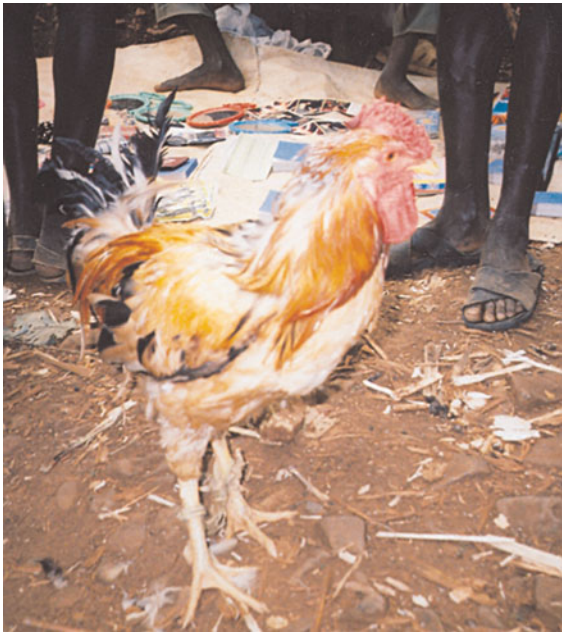
Figure 3. A Mandura chicken with a silky feather morphology prevalent in the population and predominantly characterizing the males.

also reported the white feather colour of the Farta chicken population as one of its prominent features. Conversely, the populations in the southern (Konso and Sheka), Benshangul-Gumuz (Mandura) and Oromia regions (Horro) constituted larger numbers of chickens with red body plumage compared to the population in the north (Farta). Interestingly, this pattern is compatible with the farmers' stated preferences for plumage colour in the respective regions reported by D. Nigussie et al. (unpublished data) as a separate part of this study. The fact that farmers consider plumage colour as one of the