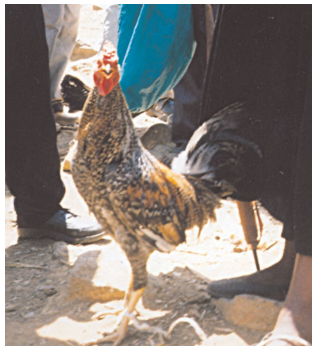
Figure 6. A Sheka male showing a triangular body shape found at a much higher proportion compared to males in all other populations, except the Horro. However, it is a characteristic feature of males in all populations.

The populations in the high altitudes (Farta, Horro and Sheka) constitute larger proportions of yellow skinned chickens relative to the others, and there were significant