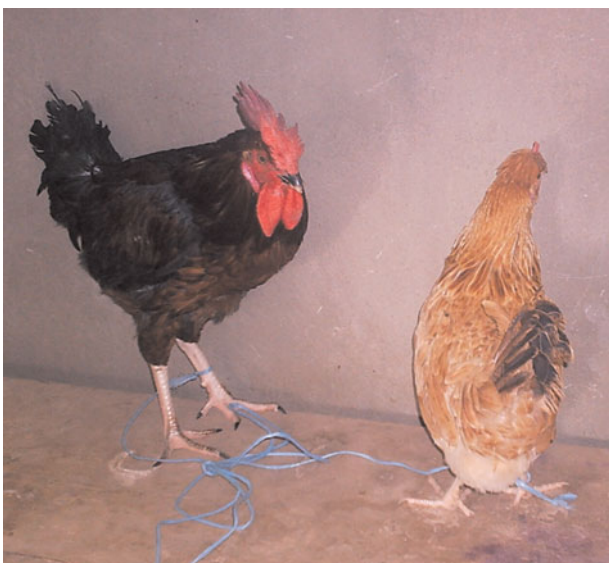
Figure 4. Male and female chickens of Horro. Males are predominantly of deep red body plumage colour.

also reported the white feather colour of the Farta chicken population as one of its prominent features. Conversely, the populations in the southern (Konso and Sheka), Benshangul-Gumuz (Mandura) and Oromia regions (Horro) constituted larger numbers of chickens with red body plumage compared to the population in the north (Farta). Interestingly, this pattern is compatible with the farmers' stated preferences for plumage colour in the respective regions reported by D. Nigussie et al. (unpublished data) as a separate part of this study. The fact that farmers consider plumage colour as one of the