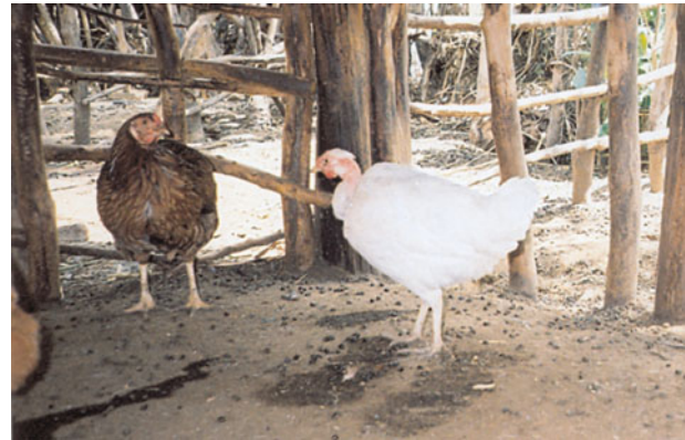
Figure 5. The Konso chicken scavenging in the family backyard. Some of the naked neck chickens recorded in this study were found in the Konso population.

important selection criteria in the traditional breeding practices appeared to have a favourable affect on the frequencies of the most preferred white and red plumage colours.