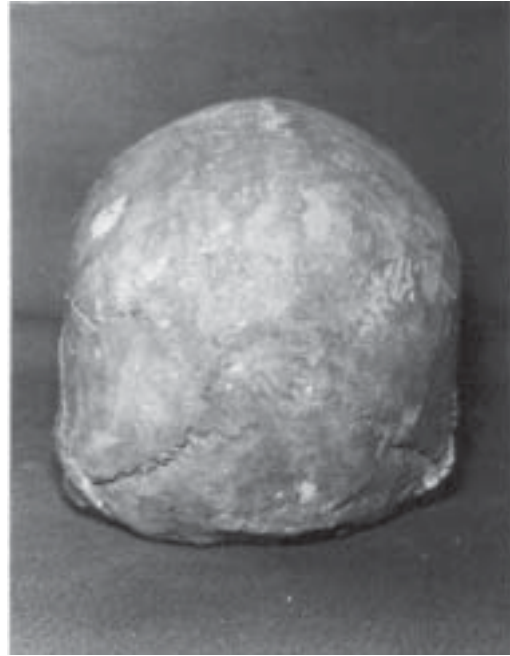
Specimen II : Occipital