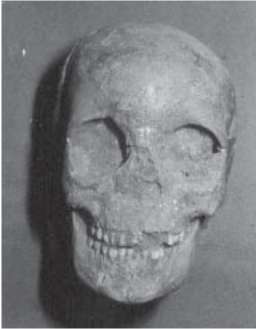
Specimen I : Frontal