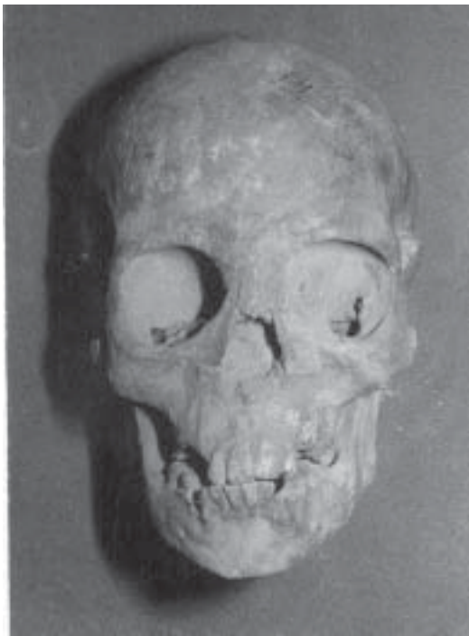
Specimen III : Frontal