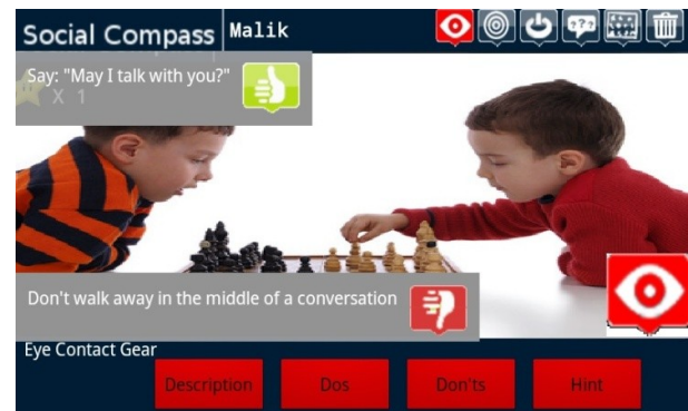
Figure 2. The MOSOCO system

Supporting real-life social situations poses new research questions and strains the design and use of currently