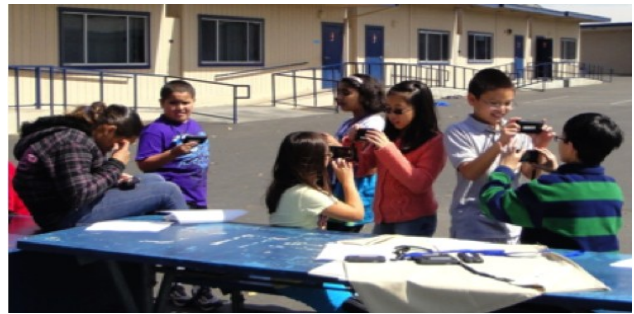
Figure 3: Students using MOSOCO during recess (left) two students making eye contact (right) Learning and tagging PIP's interests

features to encourage them to make eye contact, maintain appropriate spatial boundaries, reply to conversation initiators, share interests with partners, disengage appropriately at the end of an interaction, and identify potential communication partners. MOSOCO runs on an Android smartphone wirelessly connected to a server. MOSOCO uses the smartphone's camera to augment a real-life social situation with visual support—mimicking the Social Compass curriculum that augments social stories with paper-based visual supports.