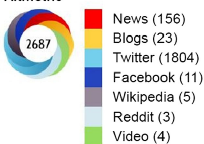
Fig. 1 Example of publication metrics (5 th article of top 100 cited articles of COVID-19)