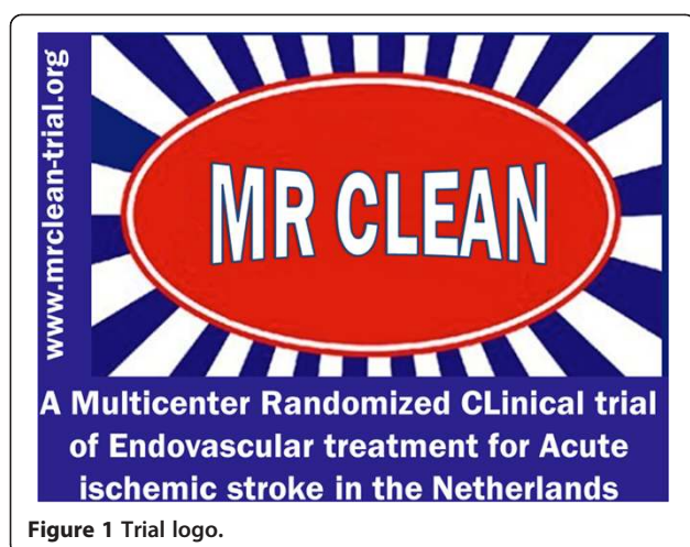
Figure 1 Trial logo.

The treatment is provided in addition to best medical management according to national and international guidelines, and may include IV thrombolysis. The study currently runs in 17 large hospitals in the Netherlands for a total period of 5 years (4 years of patient inclusion). Patient inclusion started in December 2010.