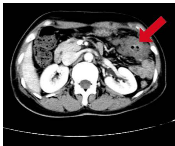
Fig. 3 Computer tomography image obtained from a 53-year-old female patient with a mucinous colorectal adenocarcinoma (5.5 × 3.0 × 2.5 cm) located in the transverse colon 55 cm from the anus. No significant enhancement compared with normal muscle in the arterial phase was observed. The patient was diagnosed as mucinous colorectal adenocarcinoma staged T4N2M1 with liver and abdominal metastases. She received 3 cycles of XELOX (capecitabine plus oxaliplatin) chemotherapy, a palliative surgery, 5 cycles of XELOX chemotherapy, and capecitabine maintenance therapy for 5 months till present

Multiple clinical trials have been performed to evaluate the prognostic value of mucinous colorectal adenocarcinoma histology. Although mucinous colorectal adenocarcinoma is different from non-mucinous colorectal adenocarcinoma in terms of gene expression and histology, the standard treatments for colorectal adenocarcinoma are recommended to mucinous colorectal adenocarcinoma patients since no clinical guidelines have been developed specifically for this group of patients. It was reported that patients with mucinous colorectal adenocarcinoma was less responsive to neoadjuvant and adjuvant chemotherapy as compared to those with non-mucinous colorectal adenocarcinoma, due to the mucinous colorectal adenocarcinoma histology